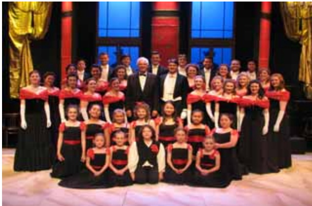
A Night in Vienna – Christmas Gala 2009

Opera Factory reserves the right to make any alteration to the calendar, programmes, cast or events that may be necessary.