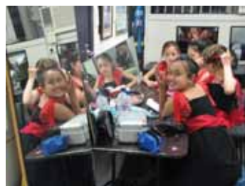
The next generation prepares