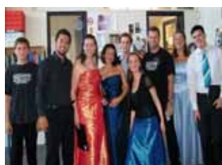
Opera by Twilight