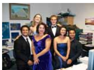
Couldrey House Wenderholm