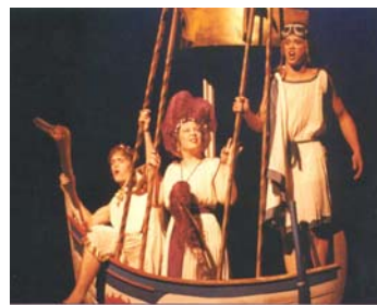
Opera Factory's 'Orpheus in the Underworld' (2000)

WE ACKNOWLEDGE & THANK OUR GENEROUS SPONSORS & DONORS Who fund many areas of our operations & facilities?