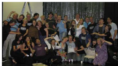
The talented cast & volunteers of our Christmas Gala!